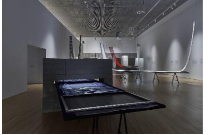
Sudo Reiko: Making NUNO Textiles, Marugame Genichiro-Inokuma Museum of Contemporary Art, 2023.