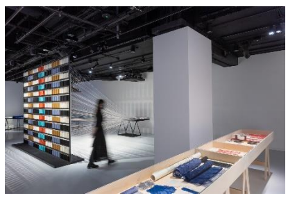
Exhibition view: MAKING NUNO: Japanese Textile Innovation from Sudō Reiko, Japan House London, 2021

The exhibition Sudo Reiko: Making NUNO Textiles was conceived and hosted by the Centre for Heritage, Arts and Textile in Hong Kong in 2019 before travelling to various locations in Europe. In Japan, following the Marugame Genichiro-Inokuma Museum of Contemporary Art, the exhibition will finally arrive at the Contemporary Art Gallery, Art Tower Mito in Ibaraki Prefecture, where Sudo was born and raised.