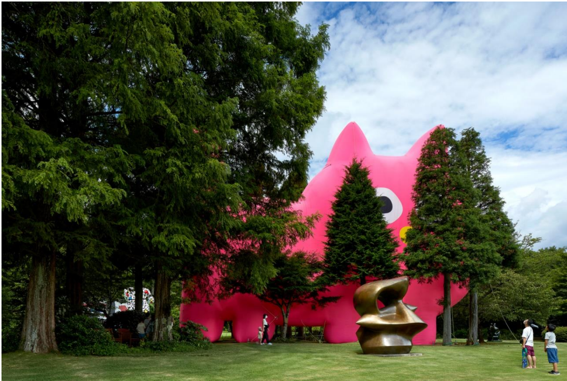
Takehiro Iikawa, Installation view: Decorator Crab – Mr. Kobayashi the Pink Cat (back view), 2022, The Hakone

For Iikawa, the ambiguity of information and limitations of sensory perception offer fertile ground for new artistic possibilities. This perspective underpins many of the installations presented in this exhibition,