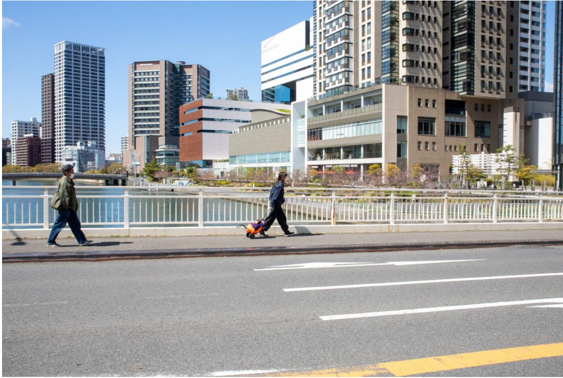
Takehiro Iikawa, Decorator Crab – Make Space, Use Space , 2022, Collaboration between the group exhibition Range of the Senses: What It Means to “Experience” Today (The National Museum of Art, Osaka) and the solo exhibition Decorator Crab – Make Space, Use Space (Hyogo Prefectural Museum of Art).