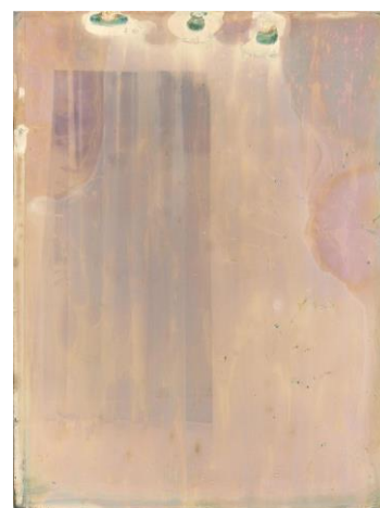
Untitled(ROC18.9.27, I/S) 2018

Venue: Gallery 9, Contemporary Art Gallery, Art Tower Mito