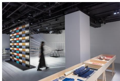
Exhibition view: MAKING NUNO: Japanese Textile Innovation from Sudō Reiko, Japan House London, 2021

The exhibition Sudo Reiko: Making NUNO Textiles was conceived and hosted by the Centre for Heritage, Arts and Textile in Hong Kong in 2019 before travelling to various locations in Europe. In Japan, following the Marugame Genichiro-Inokuma Museum of Contemporary Art, the exhibition will finally arrive at the Contemporary Art Gallery, Art Tower Mito in Ibaraki Prefecture, where Sudo was born and raised.