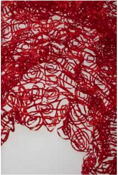
6.Reiko Sudo, Threadstray , 2006, Photo by Masayuki Hayashi