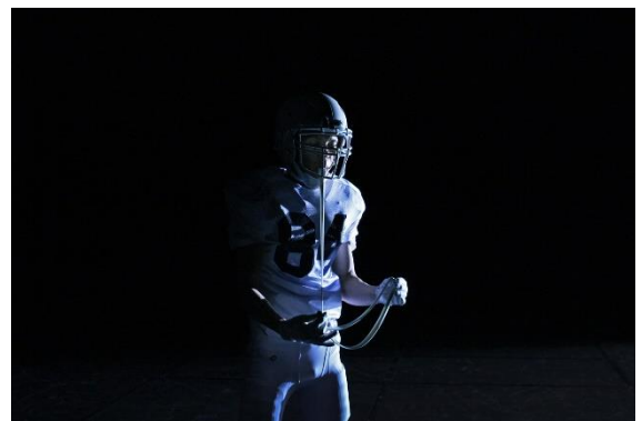
TASTELESS , Kyoto Art Theater Shunjuza, theater play, 2021