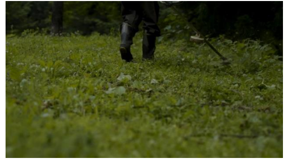
Referential image: Work-in-Progress in Ohara, 2024-